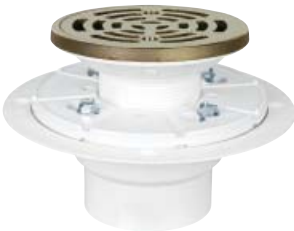
Nickel-bronze Ring & Strainer 821-200PNR