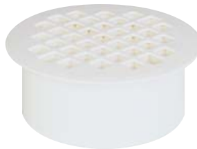
One-piece PVC 845-4P