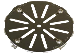
Adjustable Replacement Strainer 847-7