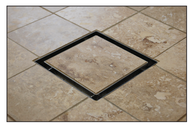
Installs like a standard drain head, but provides the look of a seamless tile floor.