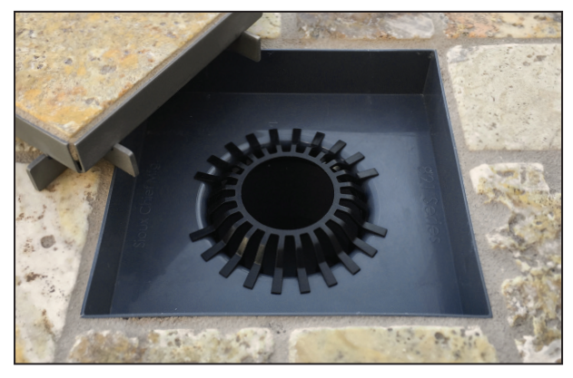
Removable hair strainer included with ABS head models