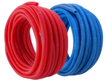
550-S12H & 550-S12C