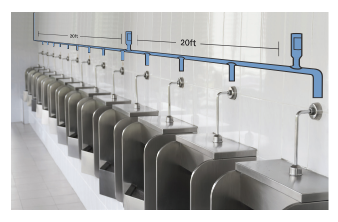
If more than 20ft, place arrester at the end of each 20-foot section, within 6ft of the end of theat section..