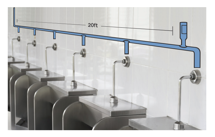
If 20ft or less, place one arrester 6ft or less from the end of the run.

Always install the properly sized arrester at or near the END of hat particular header. The "end" of the header can be defined as "between the last two fixtures," or "within 6 feet of the last fixture." In cases of headers longer than 20 feet, place the properly sized arrester for each 20 foot section at the end of that 20 foot section. For example, a 40 foot cold line header will be sized as two individual headers, and have an arrester placed at the END of the FIRST 20 foot section, and also at the END of the SECOND 20 foot section (See Figure 2).