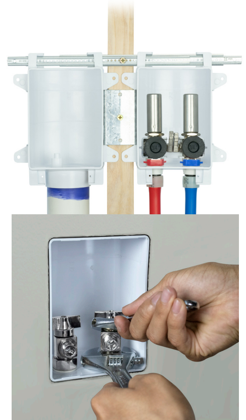
Replaceable Valves - now standard in all OxBox™ Access Products