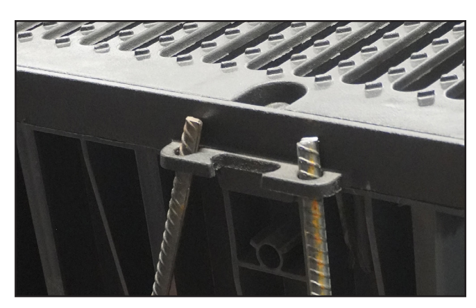
Grate frames include side anchor tabs. Tabs lock frames into the surrounding slab and work with 3/8" rebar to prevent movement before and during the slab pour.