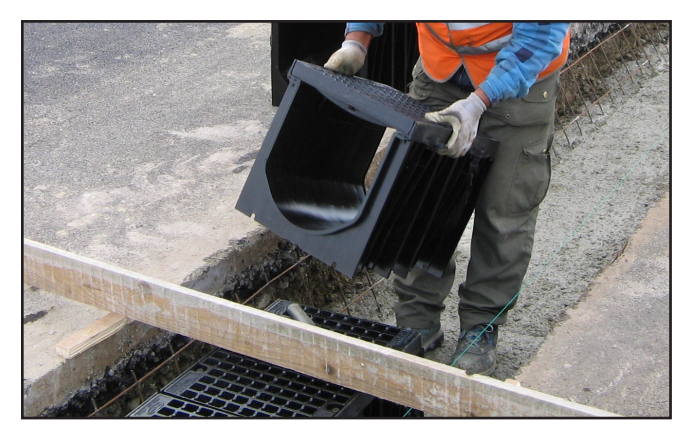
Lightweight, one-meter channel sections are relatively easy to handle, move, and set in place. Ductile iron frame/grate makes the system suitable for heavy-duty applications.