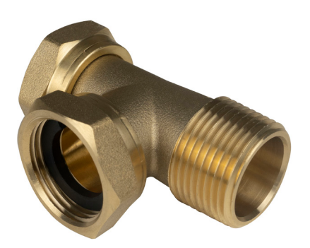
3/4" MIP x 3/4" FIP Swivel<sup>1</sup> x 3/4" FIP Swivel<sup>1</sup>