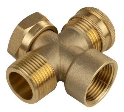
3/4" FIP Swivel1 x 3/4" FIP x 3/4" MIP x 3/4" MHT (cap)