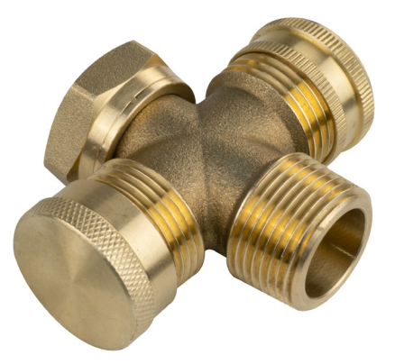
3/4" FIP Swivel<sup>1</sup> x 3/4" MIP x 3/4" MIP (cap) x 3/4" MHT (cap)