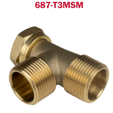
3/4" MIP x 3/4" FIP Swivel<sup>1</sup> x 3/4" MIP