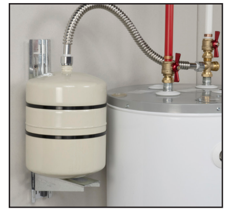
Attach the mounting column of the 2-pc. model using two or more screws (drive screws into studs) to support tank on an adjacent wall

Support base allows tank to be installed with connection on bottom for applications where tank is above heater