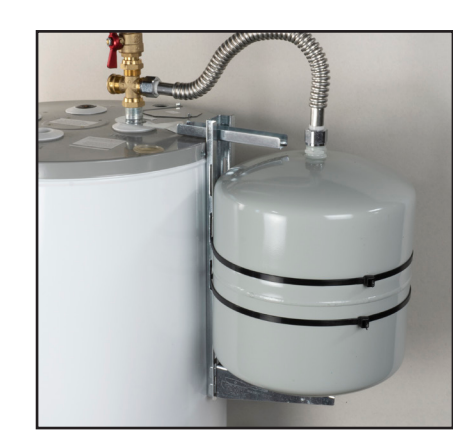
Hook the suspension beam of the 3-pc. model to the water heater nipple to support tanks vertically against the side wall of the heater tank. (Use extension piece for larger heaters)

Heavy-duty support base attaches securely to mounting column